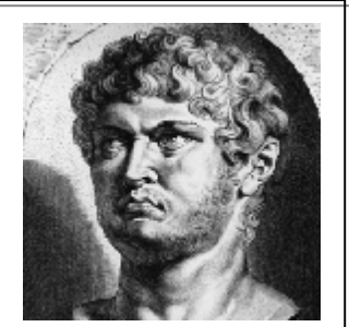
The Emperor Nero

"Mockery of every sort was added to their deaths. Covered with the skins of beasts, they were torn by dogs and perished, or were nailed to crosses, or were doomed to the flames and burnt, to serve as a nightly illumination, when daylight had expired." Tacitus. Annals XV, 44.