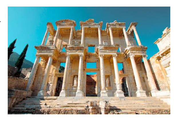
The library in Ephesus

Artemis (Diana in Roman mythology), which often included temple prostitution. Her temple ranked as one of the Seven Wonders of the Ancient World and became not just a center for worship but also the primary banking institution for all of Asia Minor. As a result, Paul's apostolic ministry that turned people to Christ and away from Artemis represented a significant financial threat to temple-related businesses like that of the silversmith, Demetrius (Acts 19:23-41). Ephesus also became a center of occult practice as many used magic, witchcraft, and sorcery to manipulate hostile spiritual powers to their advantage (Acts 19:11-20).